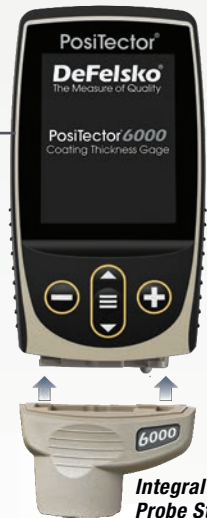
Integral Probe Style