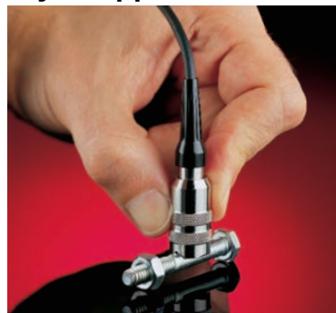
...and for measuring galvanizing, plating, anodizing, and more.