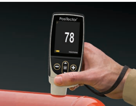
For measuring paint, powder, etc. on all metals...